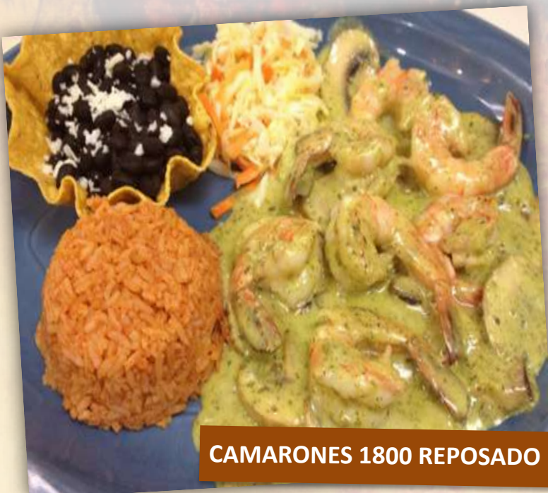
CAMARONES 1800 REPOSADO