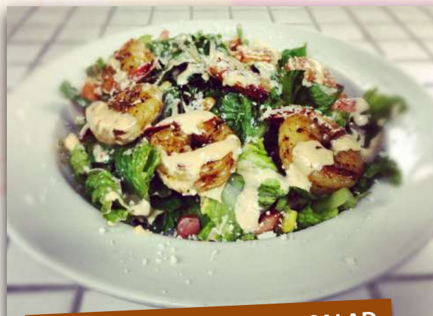
SOUTHWESTERN CAESAR SALAD