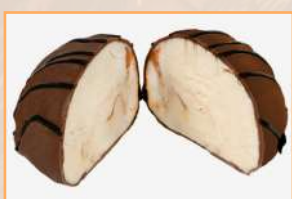
CAPPUCCINO GELATO TRUFFLE