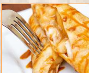
CHIMICHANGA DE MANZANA