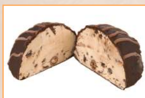
DULCE DE LECHE