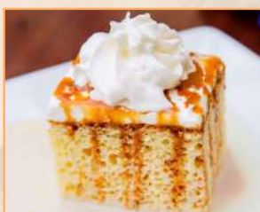
TRES LECHES CAKE