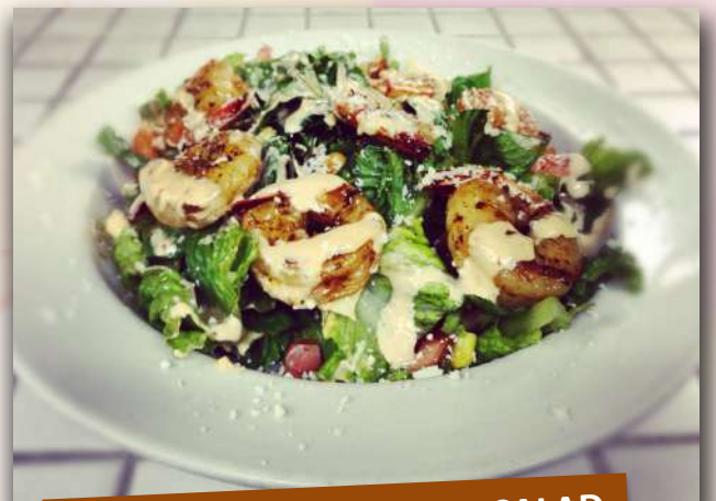
SOUTHWESTERN CAESAR SALAD