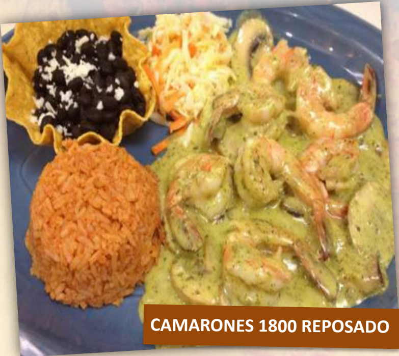
CAMARONES 1800 REPOSADO